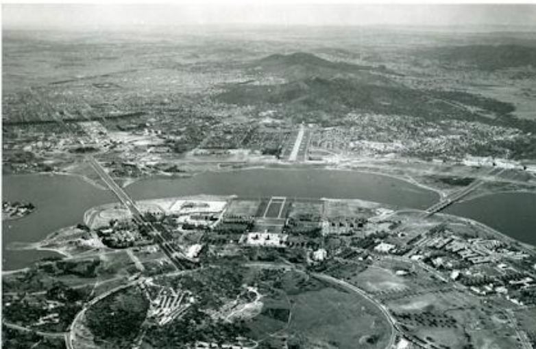
D147.7.1.1.26.6 View of Parliamentary Triangle, Canberra