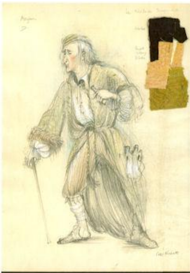
Figure 4: D1047/28/1 - Costume design for 'Argan'