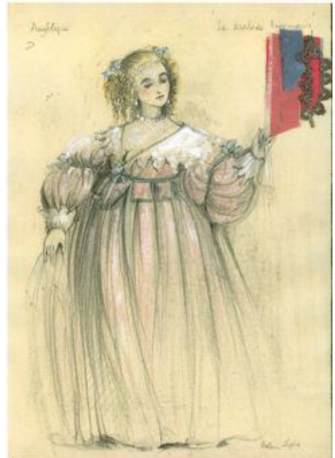
Figure 3: D1047/28/4 - Costume design for 'Angelique'

Molière's plays have continued to be popular in Liverpool's theatres, most recently with Roger McGough's critically-acclaimed adaptations of Tartuffe and Le Malade Imaginaire for the Liverpool Playhouse in 2008 and 2009.