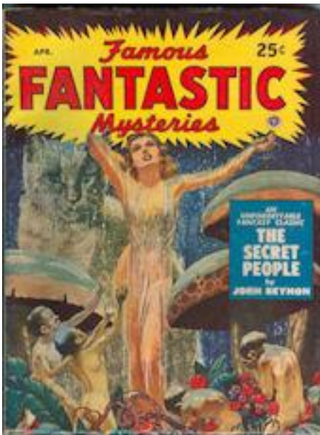
SPEC PX1000.F354 (1939-1953)

Science Fiction hub: http://www.sfhub.ac.uk/