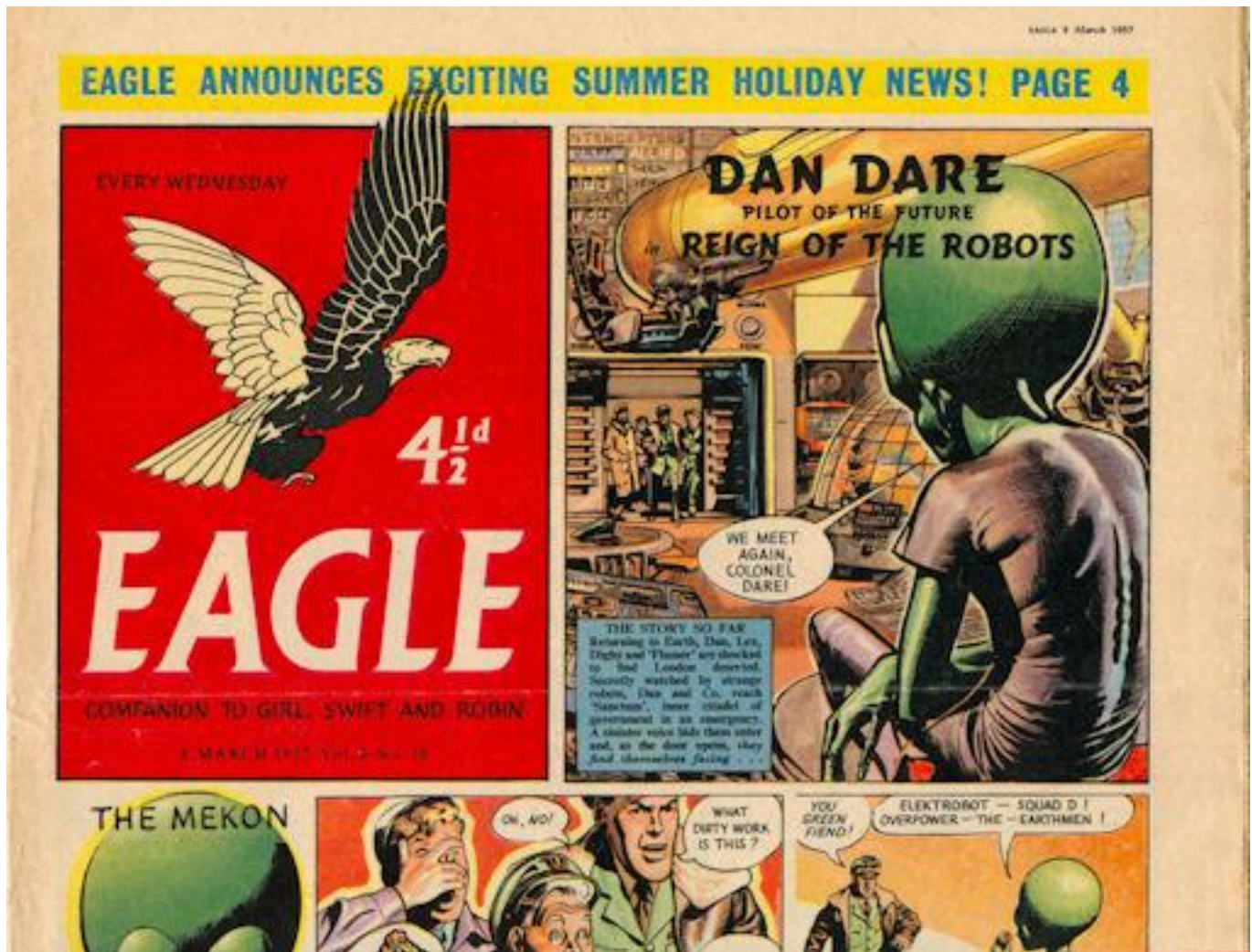
Issue of Eagle comic for 8 March 1957. University of Liverpool SPEC PN6738.E234 holdings: 1950-1960

Out of this World Science Fiction exhibition at the British Library, May-September 2011