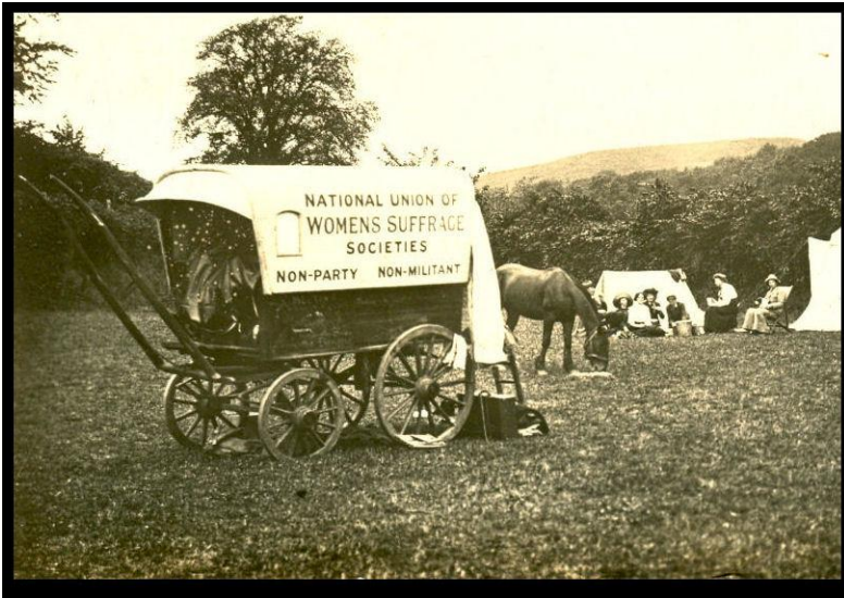
RP XIV.1.19: Postcard of women's suffrage caravan speaking tour, 1912